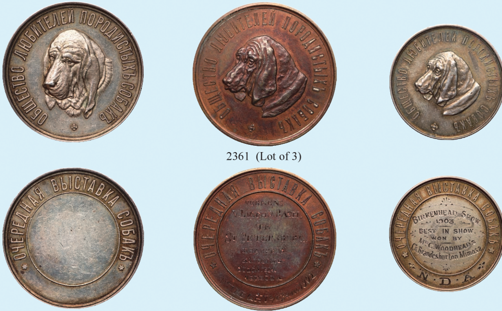
2361 (Lot of 3)