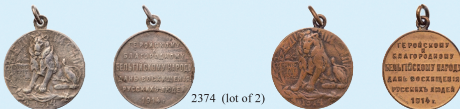
2374 (lot of 2)