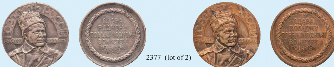
2377 (lot of 2)