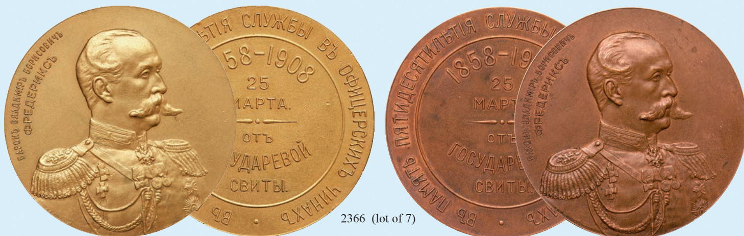
2366 (lot of 7)