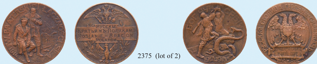
2375 (lot of 2)