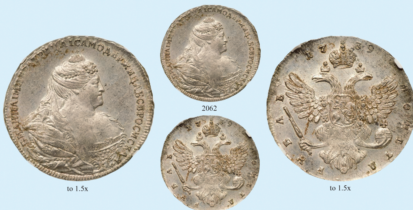
2062 Rouble 1739. Moscow, Red mint . Portrait by Dmitriev . Bit 205, Sev 1300, Uzd 0745. Needle sharp obverse detail, one minor area of striking weakness on reverse. Lovely old gray toning with original mint lustre. Authenticated and graded by NGC MS 62. Brilliant uncirculated $ 4,000