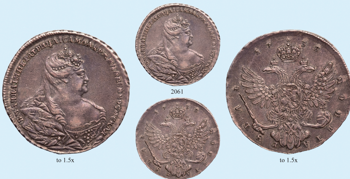
2061 Rouble 1738. Moscow, Red mint . 26.05 gm. Bit 202, Uzd 0736. Rich cabinet toning over some reverse graffiti in the field. Bold portrait. About uncirculated/extremely fine $ 1,500