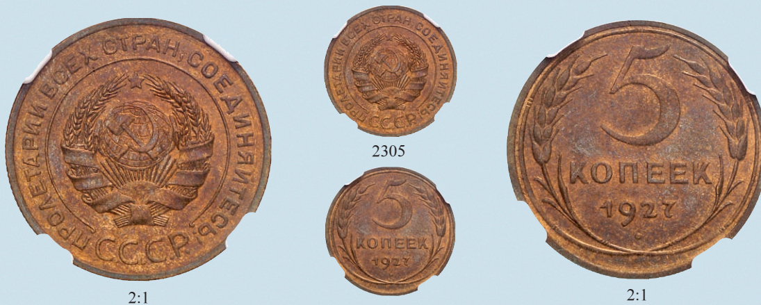
2305 5 Kopecks 1927. Fed 12, Y 93. Extremely rare date and one of the finest known. Authenticated and graded by NGC MS 64. Deep apricot with an iridescent red undertone Choice brilliant uncirculated $ 2,500