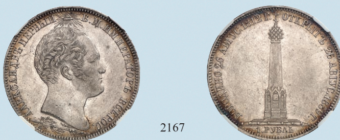
2167 Borodino Monument Commemorative Rouble 1839. By H. Gube. Bit 895, I, Sev 3303 I, Uzd 4192 (S). Authenticated and graded by NGC AU 53. Small reverse scrape. Toned About uncirculated $ 1,500