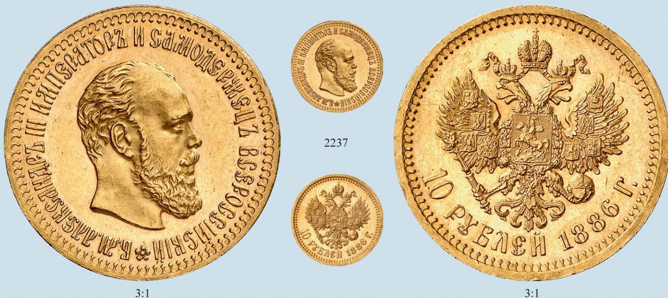
2237 10 Roubles 1886 AG. GOLD. Fr 167, Bit 15 I, Sev 529, Uzd 0291 I. Rarer date especially as a Proof. Hairline and friction marks evidence of slight mishandling Brilliant PROOF $ 25,000