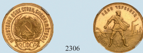
2306 1 Chervonetz (10 Roubles) 1980. GOLD. Fr 163a. Authenticated and graded by NGC PF 64 Ultra Cameo Choice brilliant PROOF $ 500