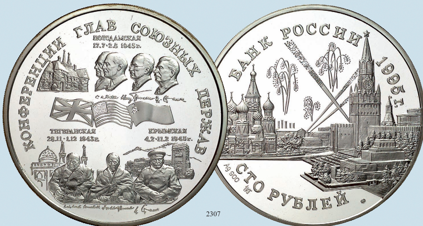
2307 100 Roubles 1995. World War II Victory . Y A387. A popular issue with only 1,500 pieces struck. A truly gargantuan coin, weighing in at nearly 29 ounces of silver Brilliant PROOF $ 2,000