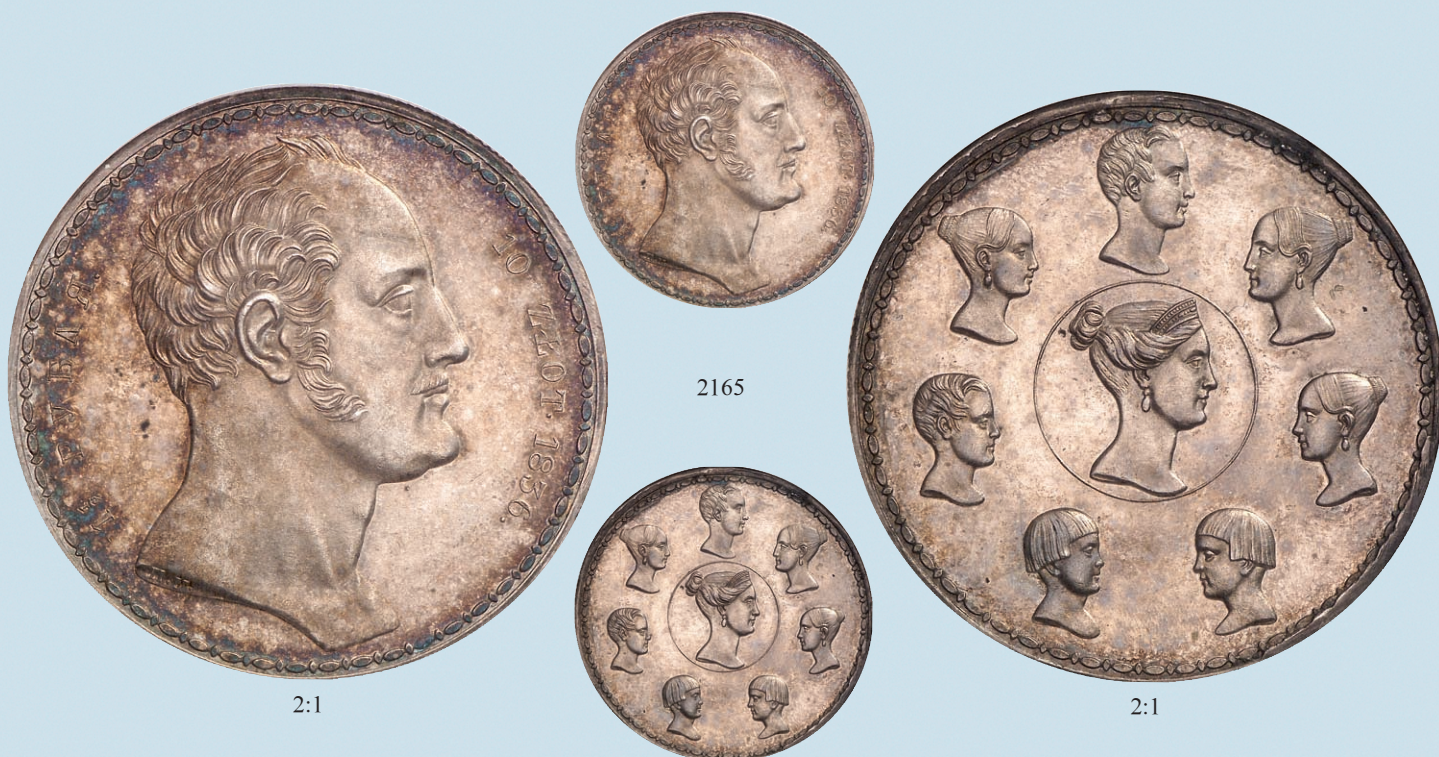
2165 Family Rouble Commemorative. 1 ½ Roubles 1836 IIY. Novodel. By P. Utkin. Bit H889 (R1), Sev 3181 (RR), Uzd 4207 (R). Nicholas I bust r. / Bust of Empress Alexandra Feodorovna r. surrounded by the cameo portraits of the Grand Dukes and Grand Duchesses. Early stage diebreak. Very rare. Authenticated and graded by NGC PF 61. Steely lavender-gray with champagne hues. Brilliant PROOF $ 50,000