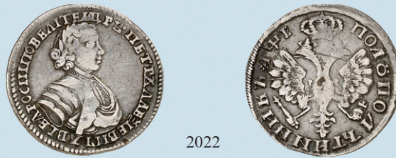
2022 Polupoltinnik АЩЕ (1705). 6.74 gm. Small head . Bit 722 (R1), Sev 156 (S), Uzd 0494 (S). Light slate gray over a few old scratches Very fine $ 1,000