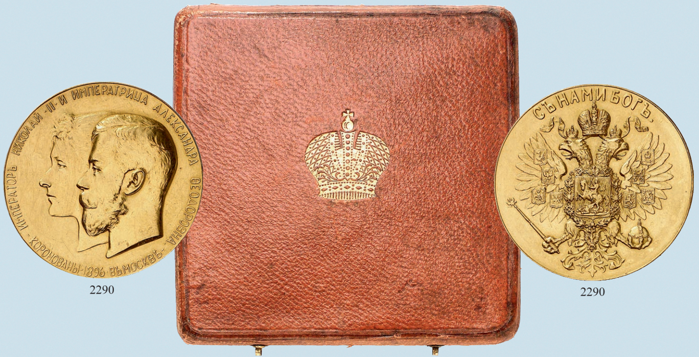
2290 Medal. GOLD. 51.5 mm. 111.1 gm. By A. Vasyutinsky. To Commemorate the Coronation of Nicholas II and Alexandra Feodorovna, 1896. Diakov 1206.2 (R3), Sm 1101/b. Conjoined heads of Nicholas II and Alexandra I. / Imperial double-headed eagle. Friction hairlines and edge marks from mishandling. Accompanied by the top half of the case of issue -- red with gold embossed Imperial crown. Extremely fine $ 10,000