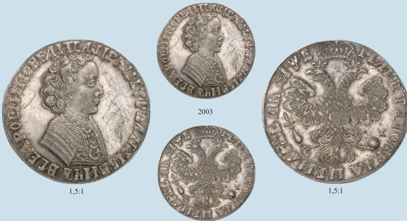
2003 Rouble АЧЕ (1705). 27.47 gm. Novodel. Bit H803 (R2), Sev 185 (S), Uzd 0484 (R). Pleasing champagne highlights and full mint lustre over some old scratches. Rare Good extremely fine $ 5,000 Ex Swiss Bank Corp., Zurich, September 19-20, 1990, lot # 1953