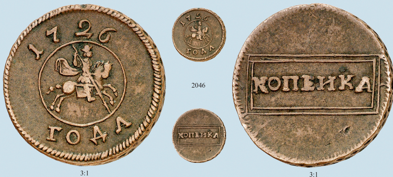
2046 Pattern Kopeck 1726. Moscow Kadashevsky mint . 25 mm. 7.93 gm. Broad, triangular brim on hat. Bit 378 (R4), B 3 (RR), Diakov 1, GM pl. XIV, 21 (Extremely Rare), Ilyin (Very Rare – 150 Rubl.), Uzd 2457. (!!). Rider right holding spear pointing downwards within circle, date above, ГОДА below / КОПЕЙКА inscribed in double-lined tablet, toothed border. With original sale tag with collector notations Choice very fine $ 125,000

Наше предложение – первый раз когда оба варианта выставлены вместе на публичные торги (и только второй раз каждая из этих монет выставлена на продажу). Счастливому нумизмату предоставляется единожды в жизни возможность пополнить свою коллекцию одним или обоими экземплярами этих удивительных монет в свою коллекцию.