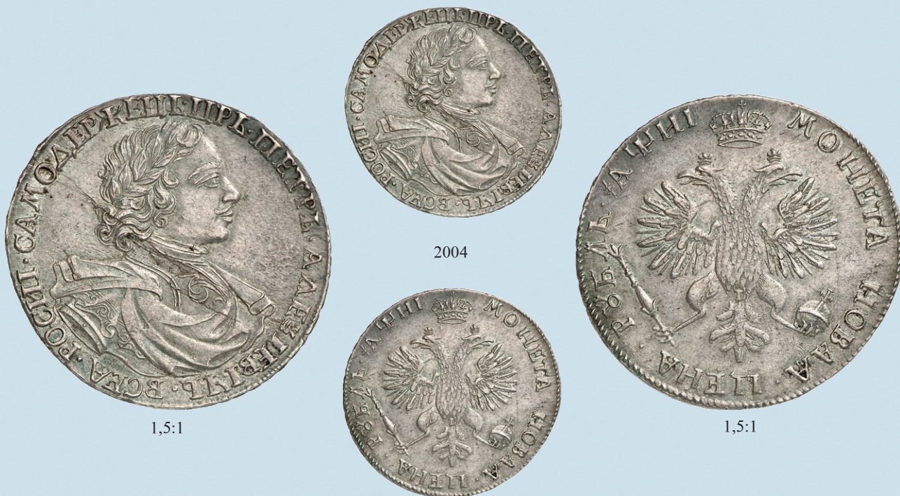
2004 Rouble АШИИ (1718) L. Moscow, Kadashevsky mint 27.56 gm. Large head, no initials. Bit 199 (R1), Diakov 4, Petrov (10 Rubl.), Sev 384 (R), Uzd 0557 (S). Obverse and reverse diebreak and traces of improper annealing during striking. Lovely light lavender gray with pale turquoise highlights. Bold strike and superior for issue. Rare Uncirculated $ 7,500