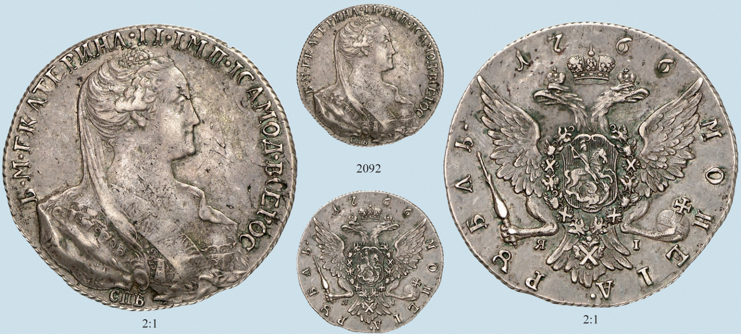
2092 PATTERN Rouble 1766 СПБ-ЯИ. 23.79 gm. Bit 974 (R4), Diakov 135 (R5), Ilyin (RRR, 300 Rubl.), GM 91 (pl. V, 14; RRR), Sev 1973 (RRRR), Uzd 0983 (!!). Crowned, veiled, stately bust of Catherine II r., large head, Imperial eagle on her shoulder / Crowned Imperial eagle. Excessively rare ; of the three known specimens of this remarkable Pattern, this example is the best. Small test cut on edge. Soft lavender-gray over trivial laminations Extremely fine $ 1,000,000

This enigmatic Pattern Rouble stands out as one of the greatest rarities of Russian numismatics. The portrait is unsigned. Who was the engraver? We as yet do not know. One of the finest Russian collections, that of Grand Duke Georgii Mikhailovich lacked an example, and the Grand Duke himself knew of only two specimens. One in the Hermitage, the other in a private collection. In the Renaissance Sale of August 2000, an example was publically auctioned. The specimen offered here, a better example than the other two, brings the count up to three extant pieces. It is, though, unsure as to whether the piece offered in the Renaissance Sale or the piece offered here is the 'private collection specimen' referred to by Grand Duke Mikhailovich.