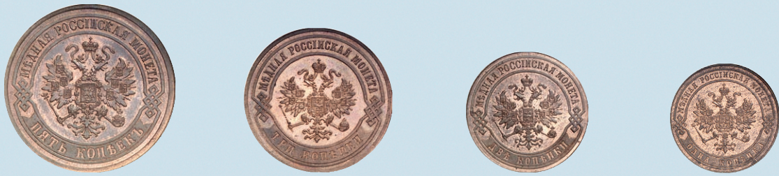
2223 (set of 4)