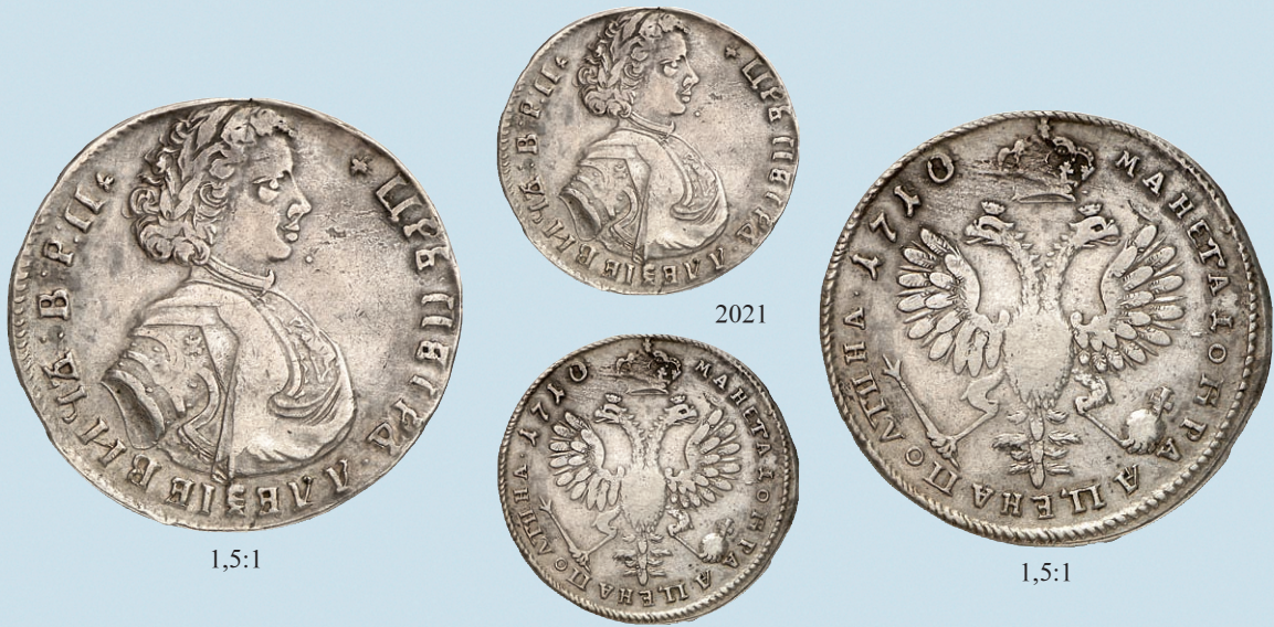
2021 Poltina 1710. 13.65 gm. Moscow, Kadashevsky mint . Bit 577 (R1), Diakov 1, Sev 259 (R), Uzd 0520 (R). Scarce . Minor flaws, moderate wear. Still an attractive coin Extremely fine $ 4,000