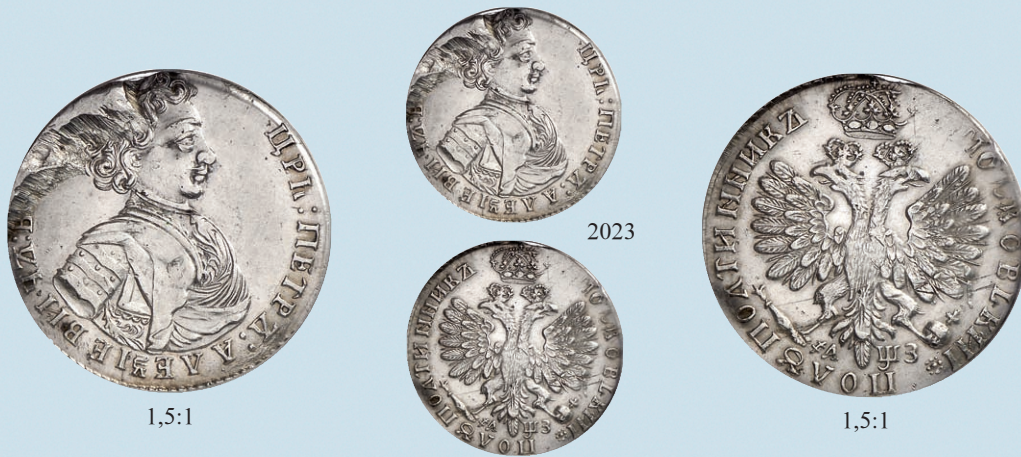
2023 Polupoltinnik ≠АЩЗ (1707). Novodel . Bit H723 (R2), Sev 225A (R), Uzd 0510 (R). Striking cud obverse edge 10-11:00. Authenticated and graded by PCGS MS 62. Steely satin gray Brilliant uncirculated $ 4,000