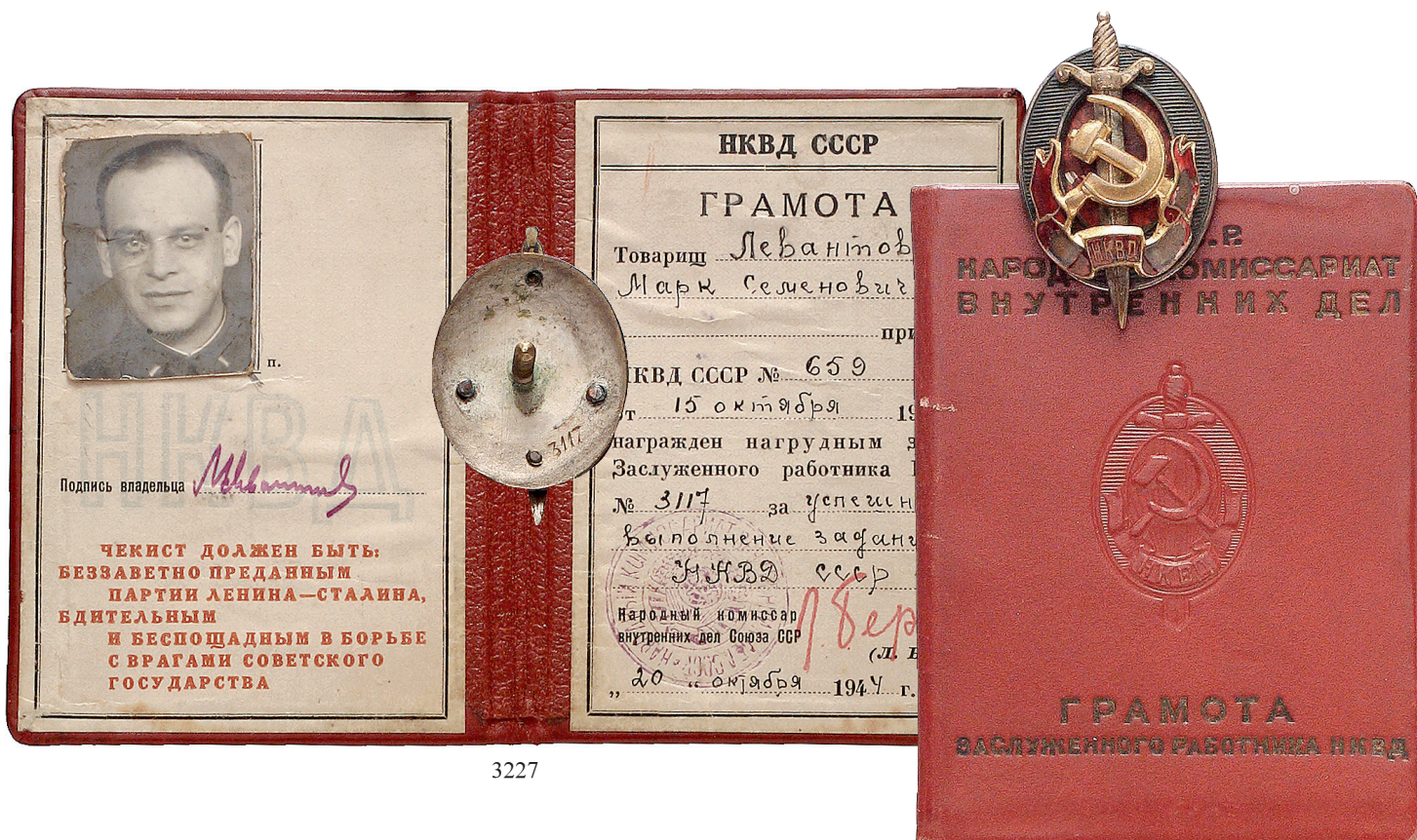
3227 NKVD Honored badge with ID booklet. 1944. Engraved # 3117. Silver, bronze, base metal. Multi-piece construction. Screwback. Oval badge, sword pointed downwards behind, superimposed with a crossed hammer and sickle. Red enameled banner below. Zak 2.1.12 (C6/C7). Award booklet with matching number issued to comrade Levantovskii M.S. on October 20, 1944. With a facsimile of Lavrentiy Beria as a People's Commissar of the Internal Affairs of the USSR.

Enamel loss from the badge's banner $ 1,500