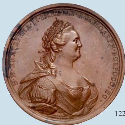
1221 (reduced to 66%)