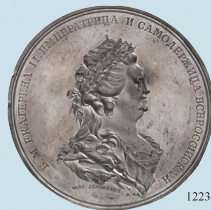
1223 (reduced to 66%)