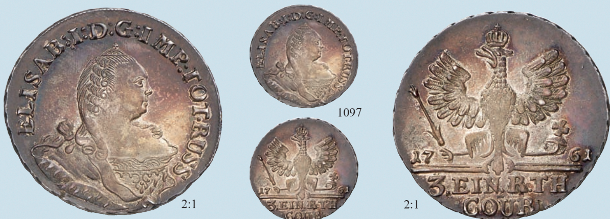
1097 1/3 Taler 1761. Moscow. 7.88 gm. Olding 451v, Bit 806v, Diakov 702 (R1), Sev 1860, Uzd 4888. Lovely deep gray with iridescent violet and blue hues. A superb example. Choice uncirculated $ 2,000

With the death of the childless Empress Elizabeth, her chosen heir and nephew Peter of Holstein-Gottorp gained the throne. In context to the Seven Years War, Elizabeth's death is often called the "Miracle of the House of Brandenburg." A great admirer of Prussia's King Friedrich II, Peter withdrew Russia from its wartime alliance, returned to Prussia the territories previously annexed and ceased production of the special Russian coinage for East Prussia. Agents for King Friedrich II were sent to systematically search out and buy up all the offensive Russo-Prussian coinage wherever it could be found. Not surprisingly, the agents were also instructed to seek out and purchase any medal for the Russian victory over the Prussians at the Battle of Kunersdorf (Friedrich's most devastating defeat).