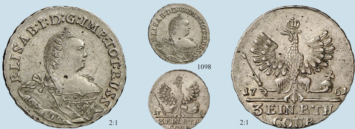
1098 1/3 Taler 1761. Moscow. 7.59 gm. Brocade-sash before bosom wider. Olding 451v, Bit 806v, Diakov 702 (R1), Sev 1860, Uzd 4888. Pale gray. Well-struck. About uncirculated $ 1,500