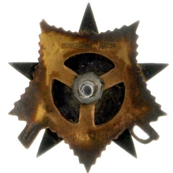
2259 Documented group of Hero of the Soviet Union Guards Colonel of Air Force Edkin V.D. Group comes with: